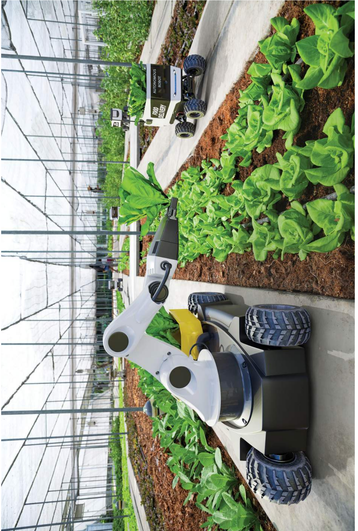
Fig. 1.1 for Question 1 Intensive food production on a farm in Thailand, an MIC in Asia